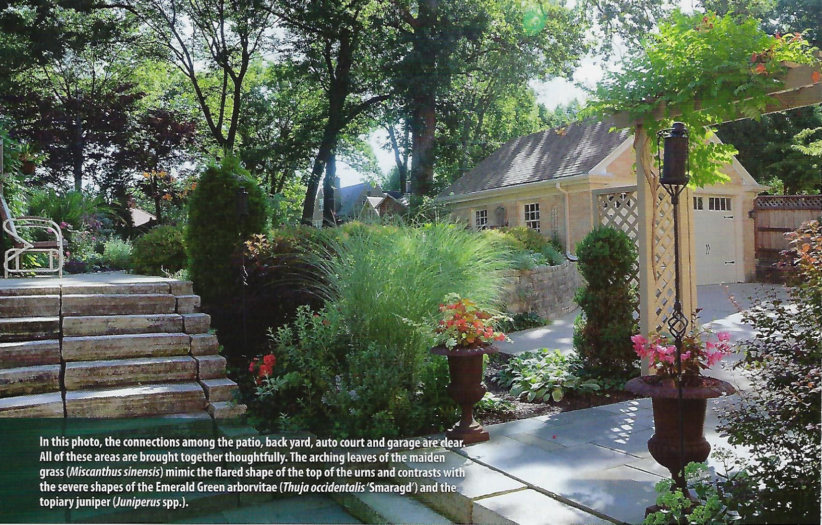
In this photo, the connections among the patio, back yard, auto court and garage are clear. All of these areas are brought together thoughtfully. The arching leaves of the maiden grass ( Miscanthus sinensis ) mimic the flared shape of the top of the urns and contrasts with the severe shapes of the Emerald Green arborvitae ( Thuja occidentalis 'Smaragd') and the topiary juniper ( Juniperus spp.).