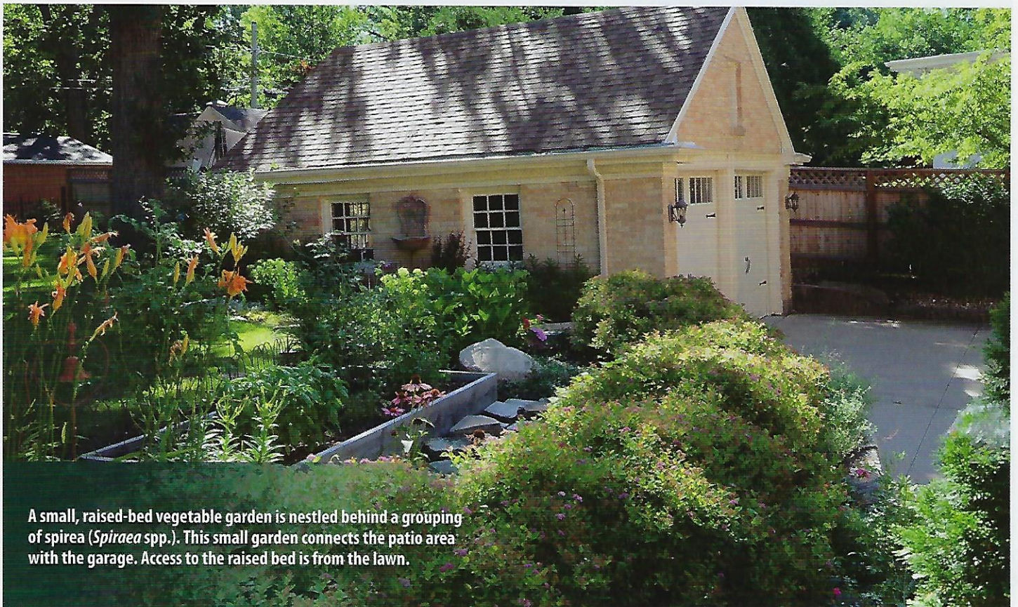
A small, raised-bed vegetable garden is nestled behind a grouping of spirea ( Spiraea spp.). This small garden connects the patio area with the garage. Access to the raised bed is from the lawn.