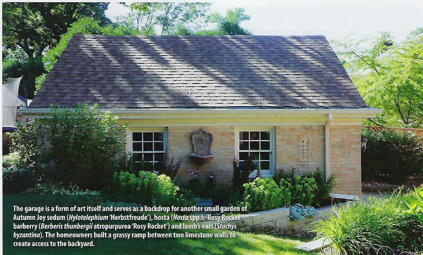
The garage is a form of art itself and serves as a backdrop for another small garden of Autumn Joy sedum ( Hylotelephium 'Herbstfreude'), hosta ( Hosta spp.), 'Rosy Rocket' barberry ( Berberis thunbergii atropurpurea 'Rosy Rocket') and lamb's ears ( Stachys byzantina ). The homeowners built a grassy ramp between two limestone walls to create access to the backyard.