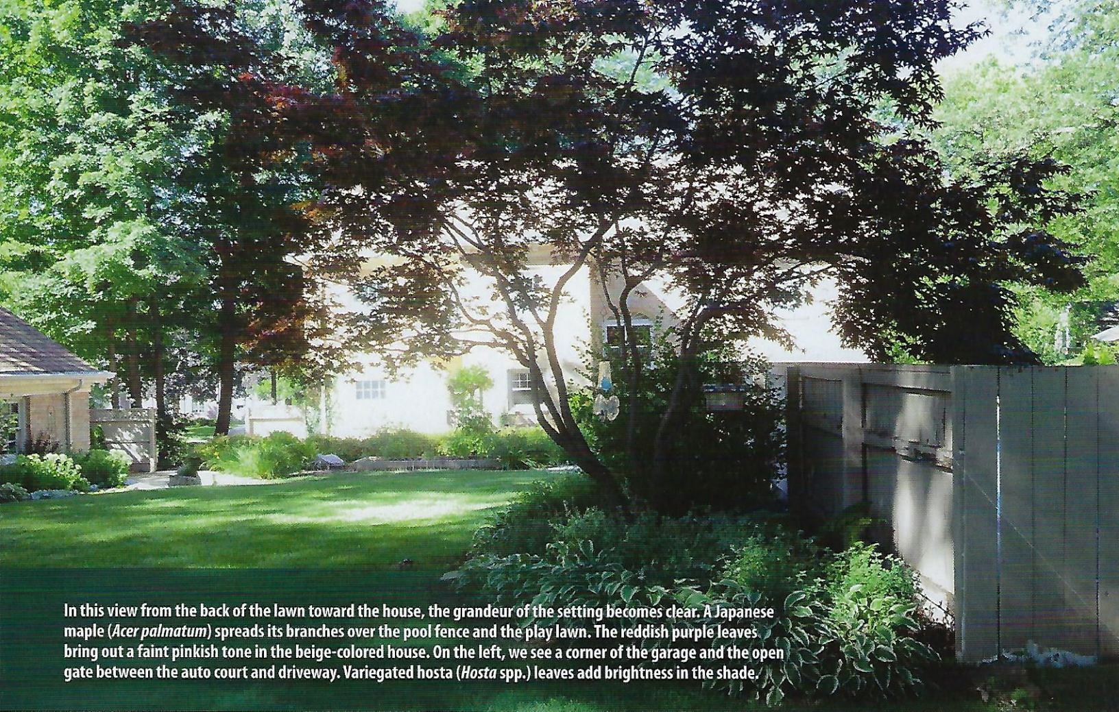
In this view from the back of the lawn toward the house, the grandeur of the setting becomes clear. A Japanese maple ( Acer palmatum ) spreads its branches over the pool fence and the play lawn. The reddish purple leaves bring out a faint pinkish tone in the beige-colored house. On the left, we see a corner of the garage and the open gate between the auto court and driveway. Variegated hosta ( Hosta spp.) leaves add brightness in the shade.