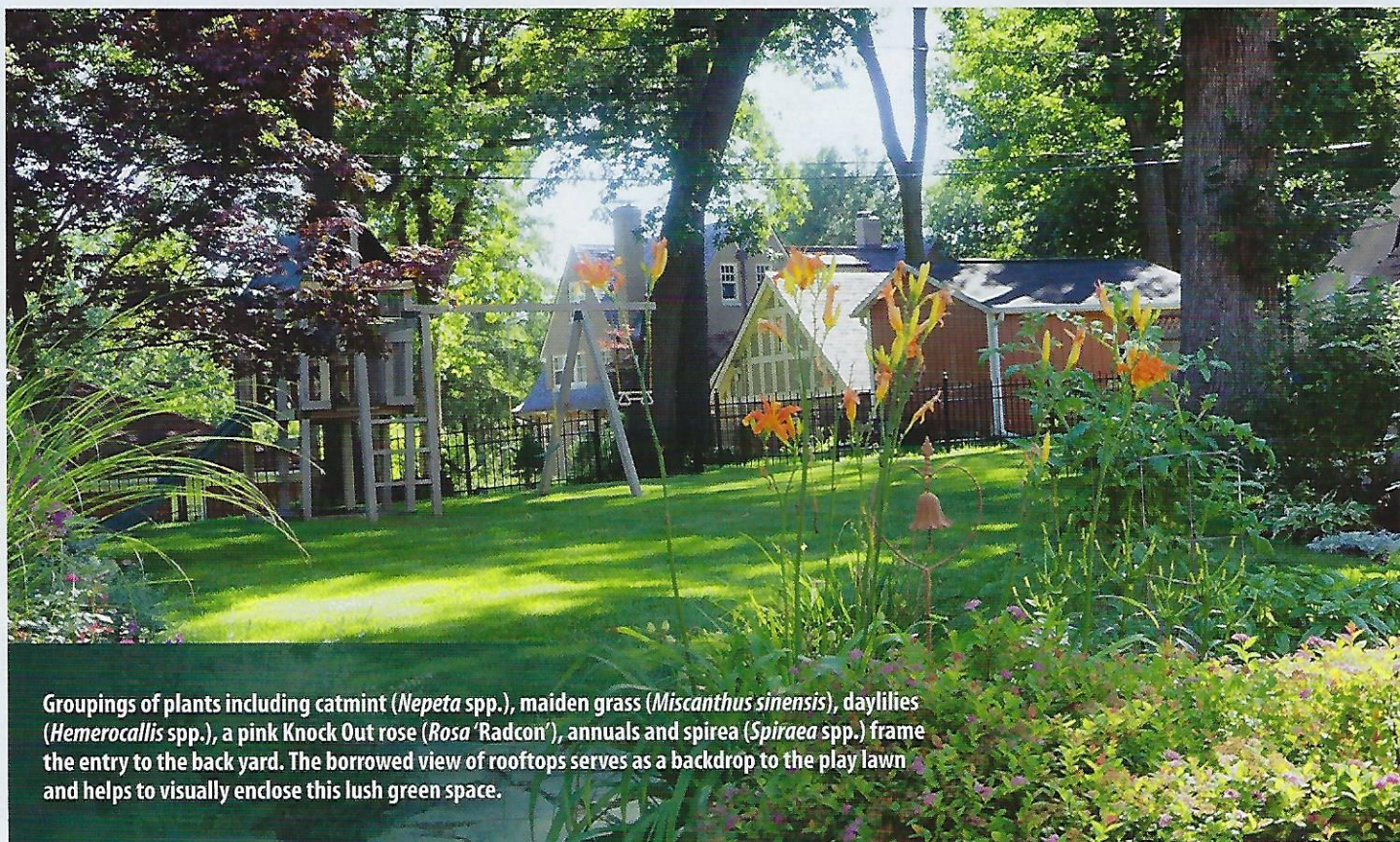
Groupings of plants including catmint ( Nepeta spp.), maiden grass ( Miscanthus sinensis ), daylilies ( Hemerocallis spp.), a pink Knock Out rose ( Rosa 'Radcon'), annuals and spirea ( Spiraea spp.) frame the entry to the back yard. The borrowed view of rooftops serves as a backdrop to the play lawn and helps to visually enclose this lush green space.