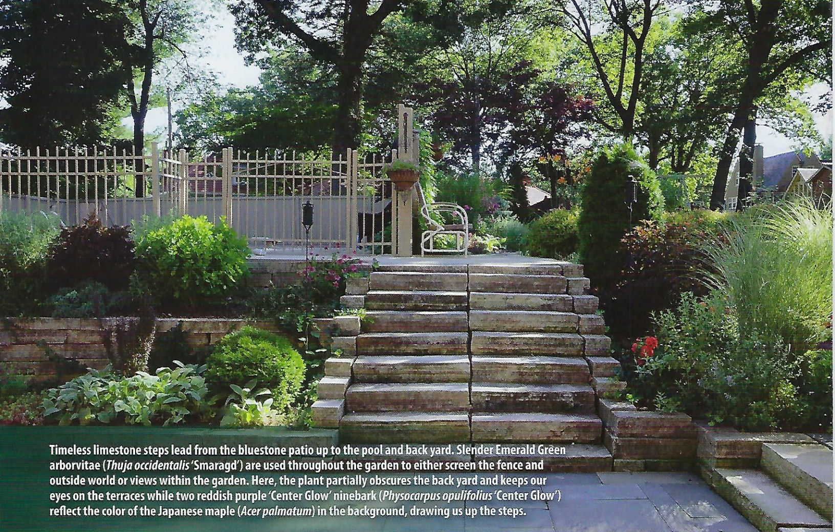
Timeless limestone steps lead from the bluestone patio up to the pool and back yard. Slender Emerald Green arborvitae ( Thuja occidentalis 'Smaragd') are used throughout the garden to either screen the fence and outside world or views within the garden. Here, the plant partially obscures the back yard and keeps our eyes on the terraces while two reddish purple 'Center Glow' ninebark ( Physocarpus opulifolius 'Center Glow') reflect the color of the Japanese maple ( Acer palmatum ) in the background, drawing us up the steps.