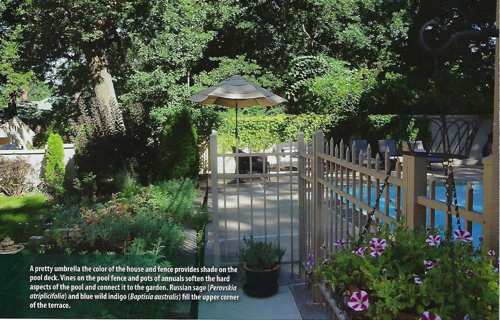
A pretty umbrella the color of the house and fence provides shade on the pool deck. Vines on the pool fence and pots of annuals soften the hard aspects of the pool and connect it to the garden. Russian sage ( Perovskia atriplicifolia ) and blue wild indigo ( Baptisia australis ) fill the upper corner of the terrace.